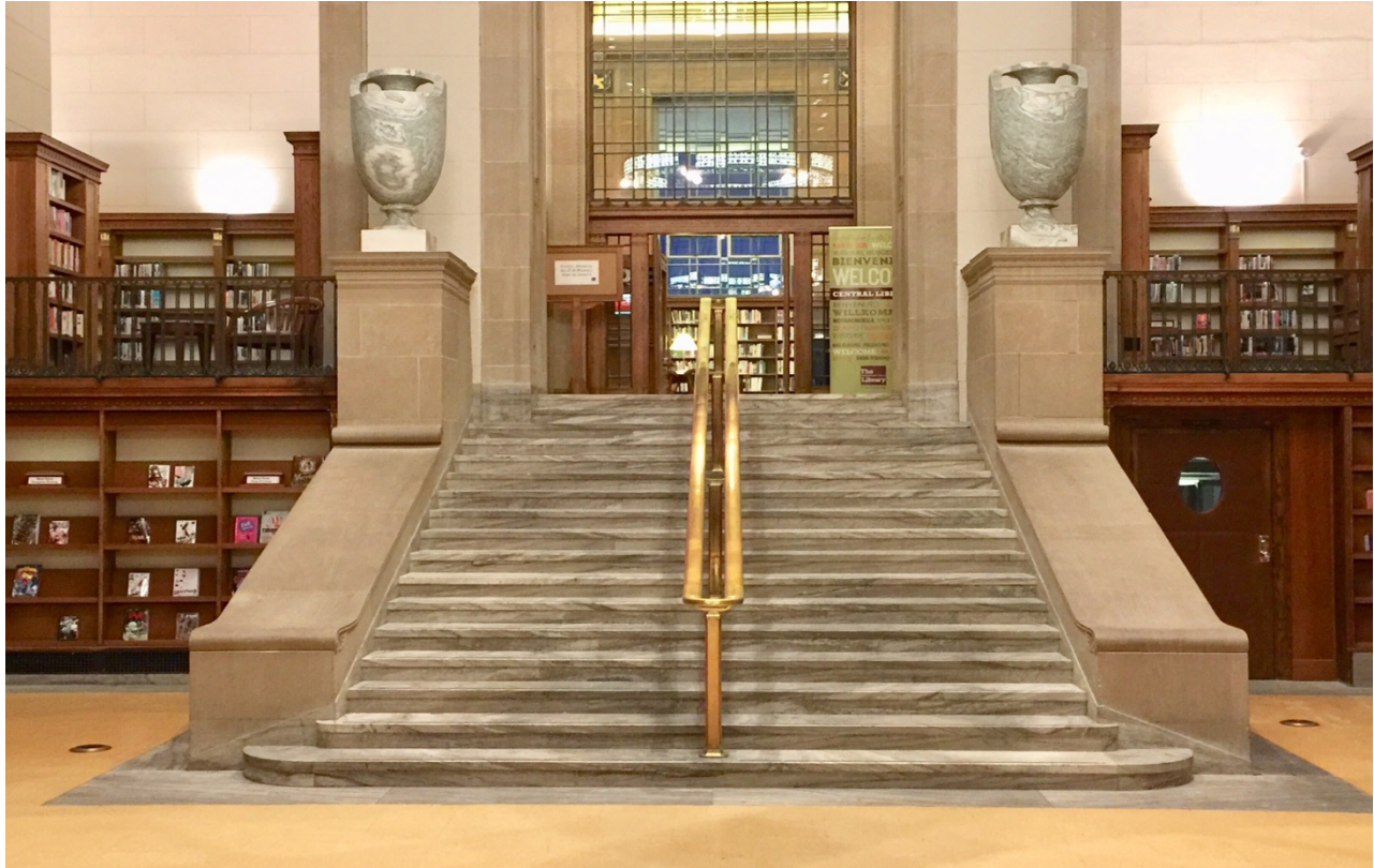
Chapter Photo Location