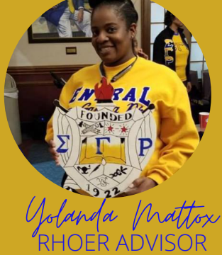
Nattox frife VISOR RHOER