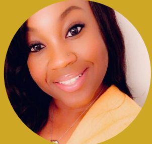
Charnel Forbes SCHOLARSHIP